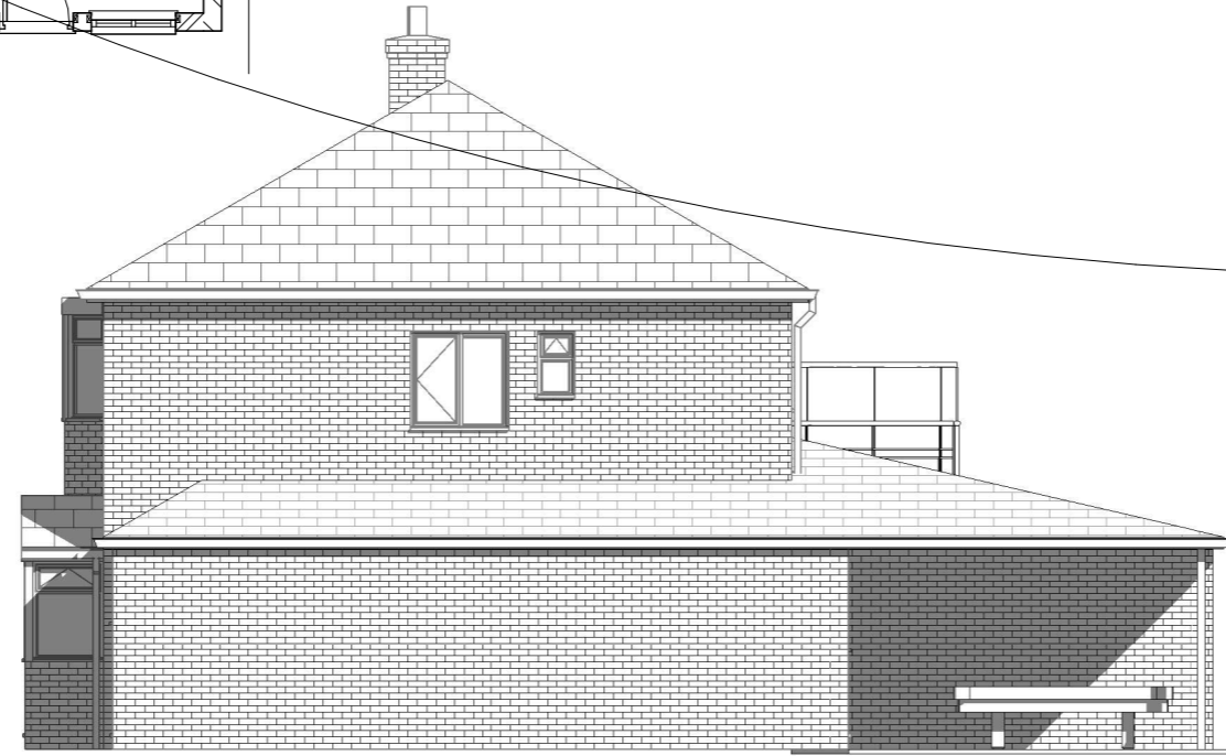
3 Gable 1 : 100