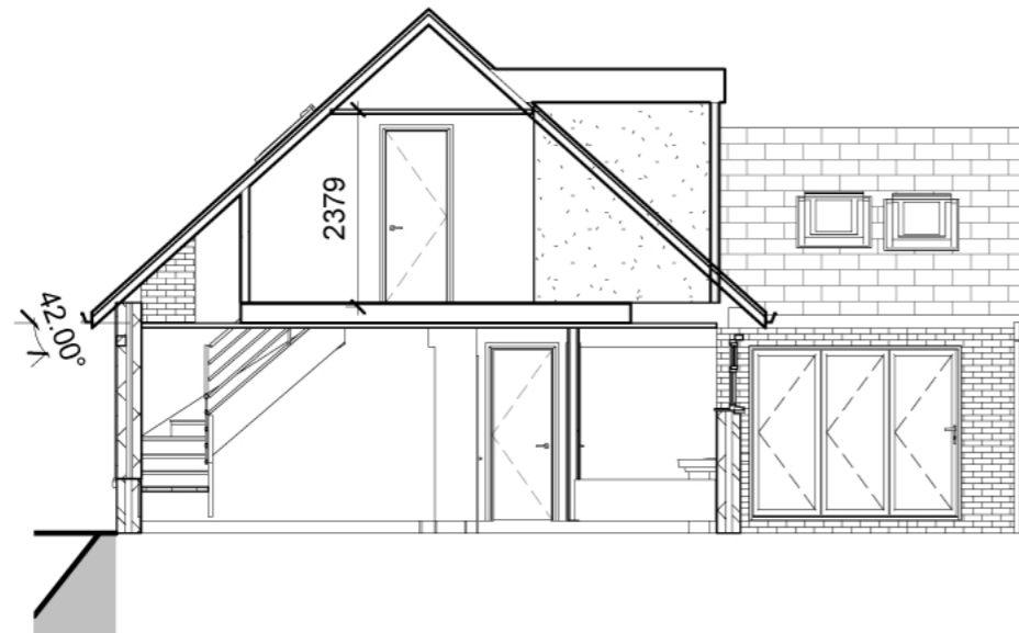
2 Section 1 1 : 100